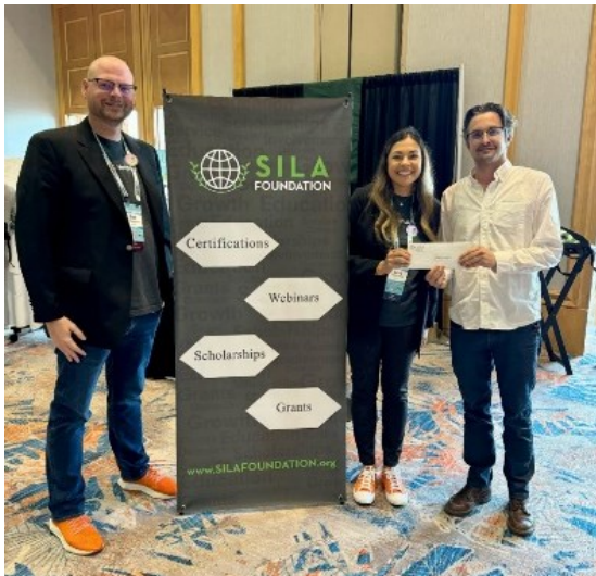
Bookleggers Library 2023 Footprint Grant Recipient